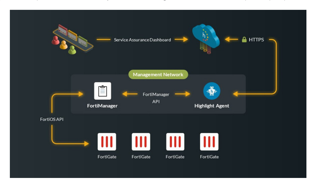
Figure 1: Highlight and Fortinet Integration.

With the automatic discovery of Fortinet SD-WAN devices and uplink interfaces, the setup process is quick and painless. These connections are grouped into locations and services alongside other overlay, underlay, and LAN connections, enabling network managers to judge network performance from anywhere from a high-level or connection-specific perspective.