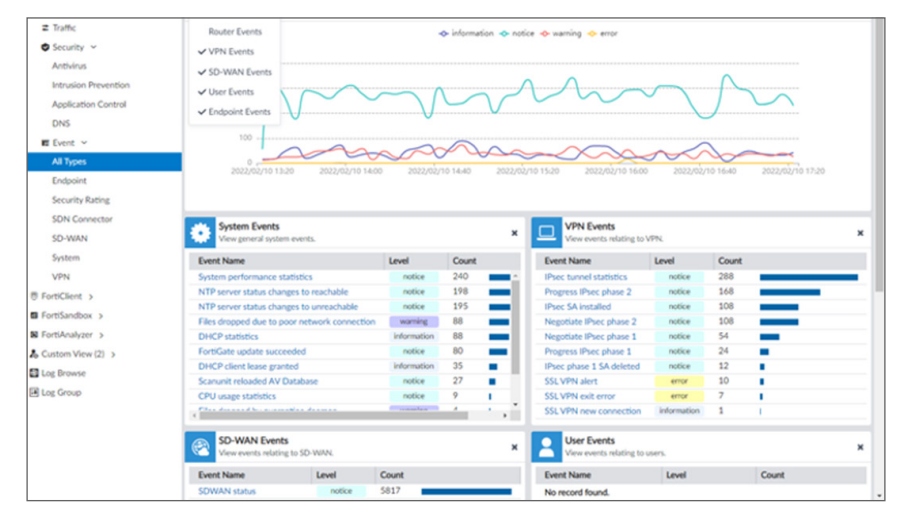
Figure 3: FortiManager dashboard view

The unique single-platform approach of the Fortinet NGFW, which includes flexible deployment options, delivers end-to-end protection that is easy to buy, deploy, and manage. Centralized security management and visibility consolidate multiple management consoles into a single pane of glass and unlock automation-driven management. Specifically, a highly intuitive view of applications, users, devices, threats, cloud service usage, and deep inspection gives network engineering and operations leaders a better sense of what is happening on their networks. This strategic view allows them to easily create and manage more granular policies to optimize security and network resources.